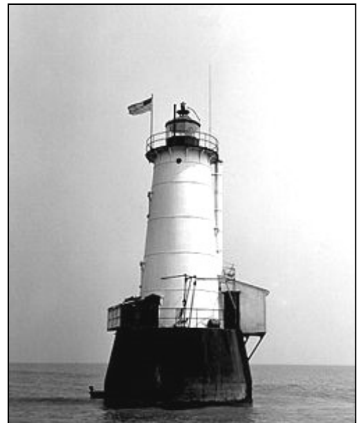
Great Beds Light (South Amboy), as it looks today.