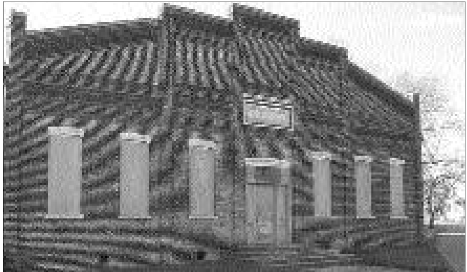
The South River Coat Company on Division Street as it exists today.

During the war period the South River Coat Company contracted with the government to make uniforms and combat-coats of special design. All contracts included strict specifications. However, the South River Coat Company established an enviable reputation in meeting the government's requirements in all.