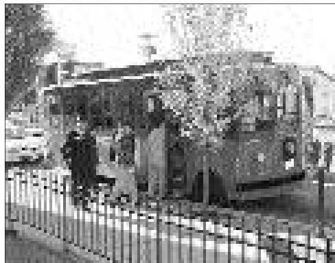
Above: A Historic Trolley Tour sponsored by the Middlesex County Cultural and Heritage Commission’s makes it’s first stop at the Old School Baptist Church.