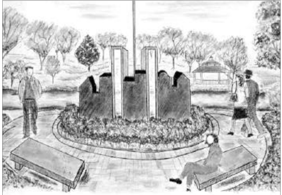
Artists rendering of proposed September 11th memorial slated for Dailey's pond.

Councilman Londensky explained that the memorial will represent the Manhattan skyline, it will be approximately 5 feet high, and the replicas of the twin towers approximately 8 feet high. The towers will be sculpted out of clear material, and the memorial will be engraved in memory of those lost. It will be surrounded by white concrete and marble benches, with brick walkways leading up to it. Bricks are being sold to offset the cost of the memorial. The bricks are being supplied and engraved by Riverside Supply Co. More than 400 bricks and all four benches have already been sold. Bricks will be sold in front of the museum on Cruise Nights. Individual/Family bricks are $50. Business/Clubs/Organizations can purchase the brick for $75.00. For more information contact the South River Borough Hall at 732-257-1999 Ext. 306. Act fast, September is right around the corner.