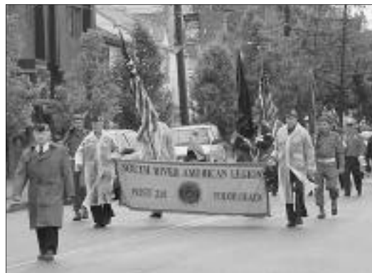
American Legion members march with pride.