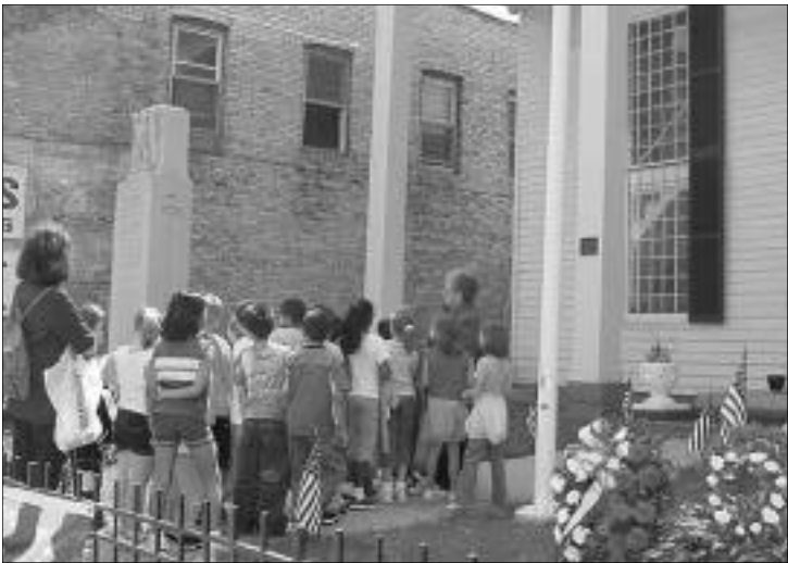
Third grade students visit the museum on May 16 for Government Day.