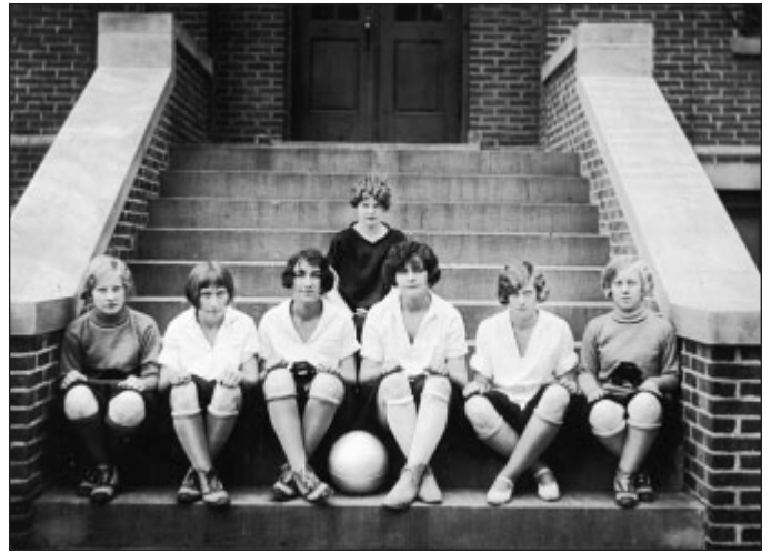
South River Girls Basketball Team. By the looks of the the hair style — this photo was taken sometime during the 1920's!